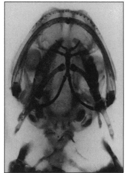
Ventral view of the skull and hyobranchial apparatus of a salamander. The hyobranchial apparatus supports the gills in larval salamanders and the complex, projectile tongue in metamorphosed adults. [From the dust jacket of volume 3 of The Skull ]

Ten years ago, Carl Gans and Glenn Northcutt argued that the head anterior to the notochord is uniquely derived in vertebrates and intimately associated with the evolution of two novel ectodermal tissue types, neural crest and epidermal placodes. Gans returns to this question in the current work and summarizes the now overwhelming support for this premise. This and many