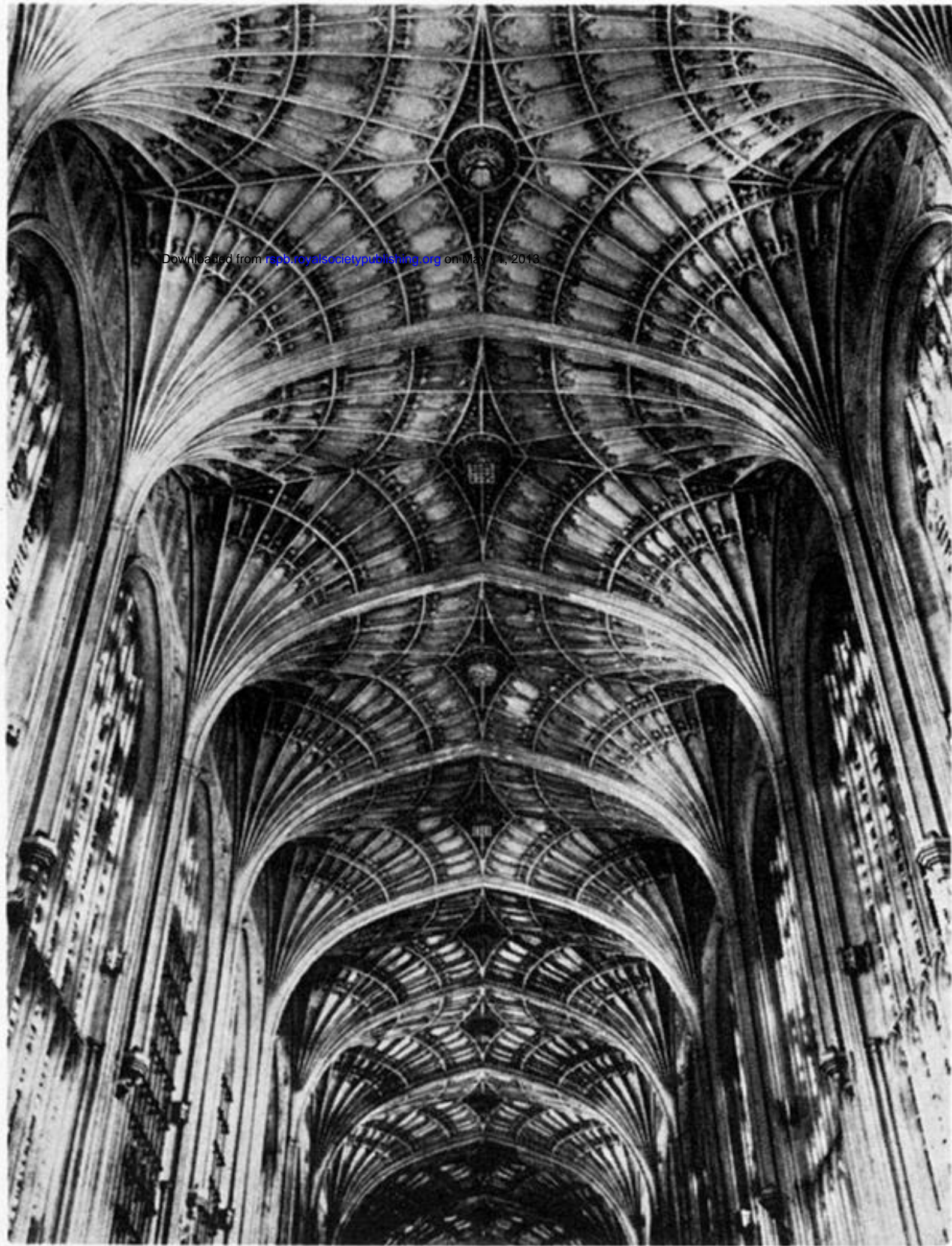
FIGURE 2. The ceiling of King's College Chapel.