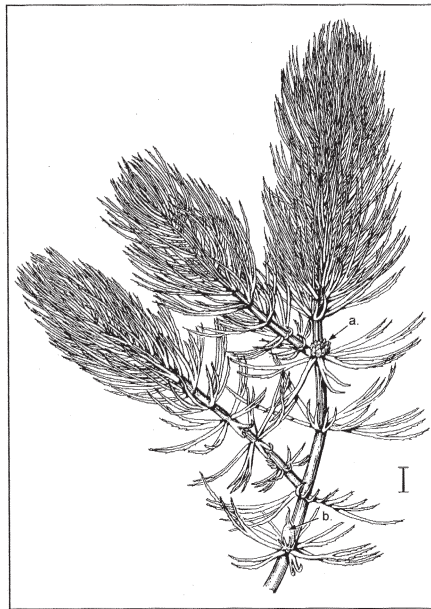
Figure 4. Ceratophyllum is a water-pollinated dicot with minute unisexual flowers. Pollen released underwater from dehiscing anthers (a) must pass through the water to a small opening in the side of the pistillate flower (b) to complete pollination. Ceratophyllum is an example of a species that carries out every aspect of its life cycle (except, perhaps, dispersal) in complete submergence. Bar = 1 cm.

It was presumably because of selection in habitats disruptive to biotic systems that abiotic pollination systems evolved in angiosperms (Whitehead 1969). If the aquatic environment is inherently disruptive to biotic pollination, abiotic pollination should predominate in aquatic plants. Cook (1988), however, showed that the incidence of wind pollination in aquatic genera is only 31%, reflecting their ancestry from