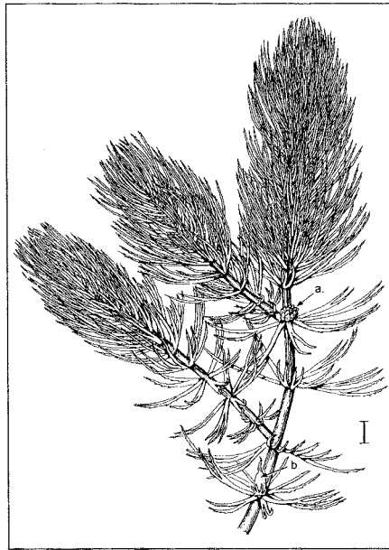
Figure 4. Ceratophyllum is a water-pollinated dicot with minute unisexual flowers. Pollen released underwater from dehiscing anthers (a) must pass through the water to a small opening in the side of the pistillate flower (b) to complete pollination. Ceratophyllum is an example of a species that carries out every aspect of its life cycle (except, perhaps, dispersal) in complete submergence. Bar = 1 cm.

It was presumably because of selection in habitats disruptive to biotic systems that abiotic pollination systems evolved in angiosperms (Whitehead 1969). If the aquatic environment is inherently disruptive to biotic pollination, abiotic pollination should predominate in aquatic plants. Cook (1988), however, showed that the incidence of wind pollination in aquatic genera is only 31%, reflecting their ancestry from