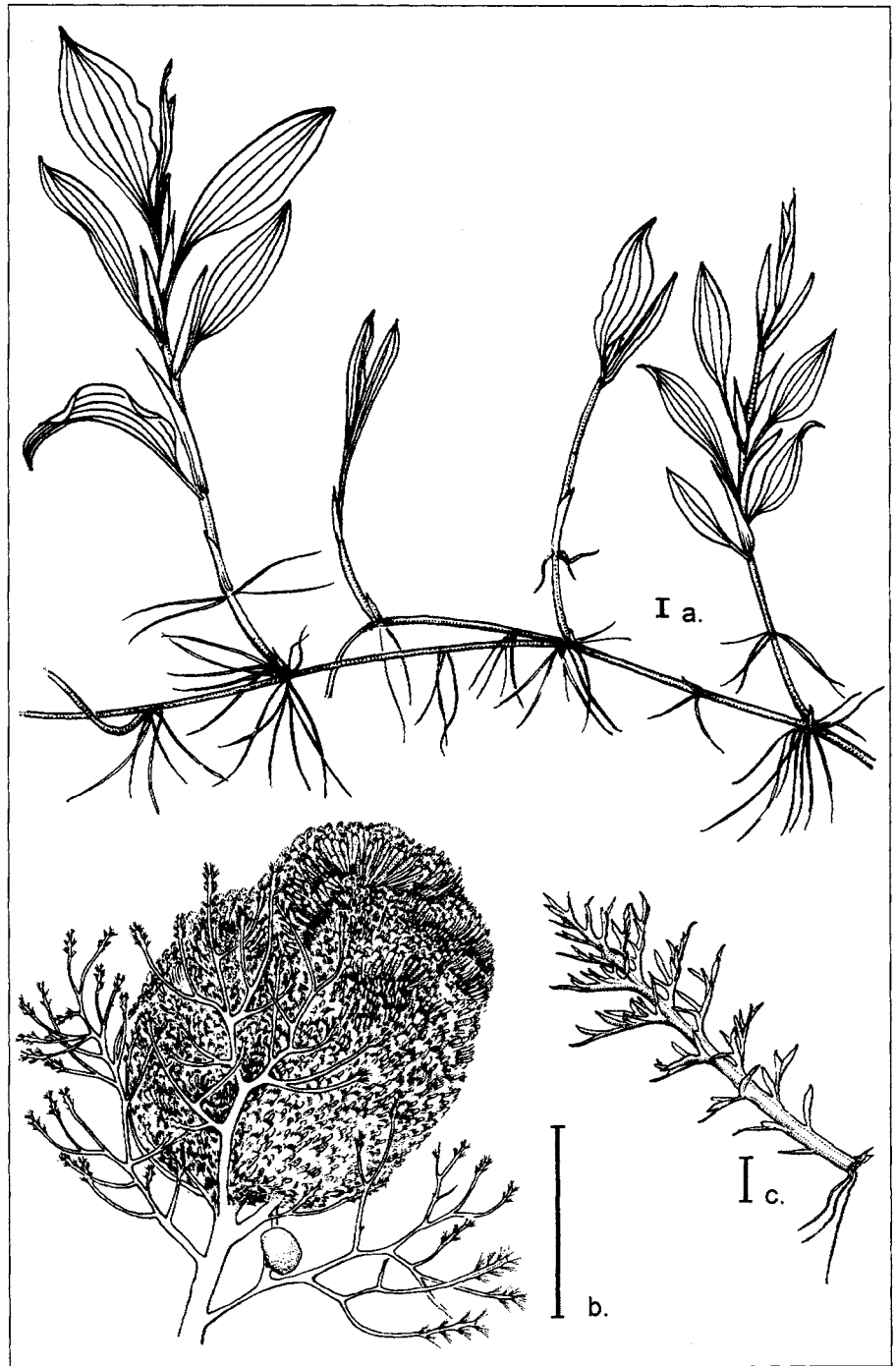
Figure 2. Aquatic plants employ many types of vegetative structures for reproduction. (a) Modified horizontal stems (rhizomes) grow quickly to anchor aquatic plants in unconsolidated, shifting substrates. This specimen of pondweed ( Potamogeton amplifolius ) resulted from the planting of a small four-leaved fragment that initially lacked a rhizome. The growth illustrated here occurred during a single summer season. (b) Highly specialized vegetative leaves help to insulate this spherical turion of bladderwort ( Utricularia vulgaris ). Turion leaves differ morphologically from normal foliage leaves such as those subtending the structure. Turions resist unfavorable environmental conditions and are efficient propagules for aquatic plants. (c) Severed or injured vegetative tissue is capable of generating "gemmaiparous" plantlets in several aquatic species, such as lake cress ( Neobeckia aquatica ). Detached leaves (shown here) or nearly any part of a lake cress plant (as small as 0.5 mm) can produce a gemmiparous plant. However, populations of this species have declined significantly because it is sexually sterile and the vegetative fragments function poorly in long-distance dispersal. Bars = 1 cm.

The most notable vegetative propagule in aquatic plants is the turion (Figure 2b), a specialized structure with few functional coun-